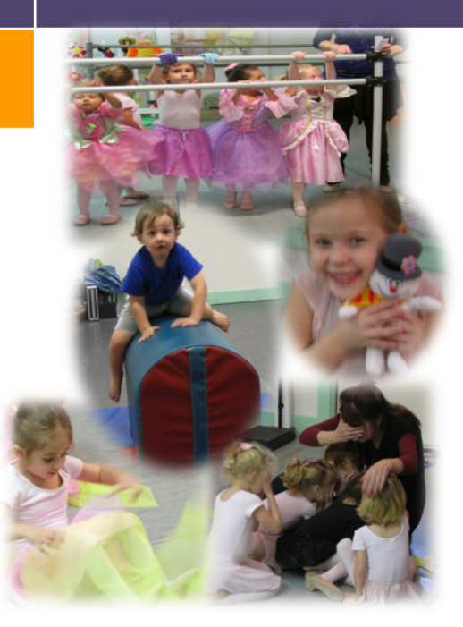
Students must be at least 3 years old as of September 1,2021 and potty-trained.

www.EAdance.com Facebook.com/EAdance <u>enavantstudio@yahoo.com</u> Phone: 281-391-7779 Location: 2525 Porter Rd Mail: PO Box 1259, Katy 77492